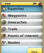
Touch screen Menus