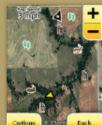
Outdoor & Wildlife Management Icons